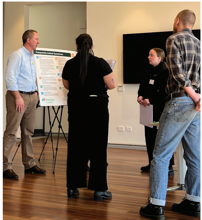
Community information session at Mullion Creek

The community consultation to date represents an opportunity for Iberdrola Australia to meet the community and share information and receive feedback. We will continue to attend local community events and host community meetings as the prospect develops.