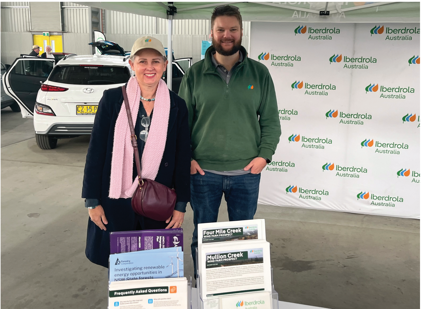
Our team at the Orange Sustainable Living Expo

Our KPMG audited 2023 Sustainability Report is available on our website presenting our sustainability initiatives and community engagement in regional Australia.